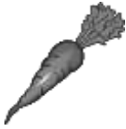
Exhibit Entry Guidelines for Vegetables and Fruit